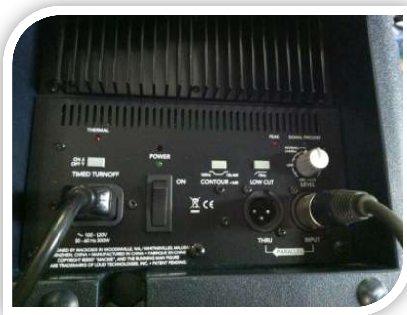
Speaker wiring " MIXER OUTPUT connects to INPUT "